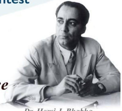
Dr. Homi J. Bhabha